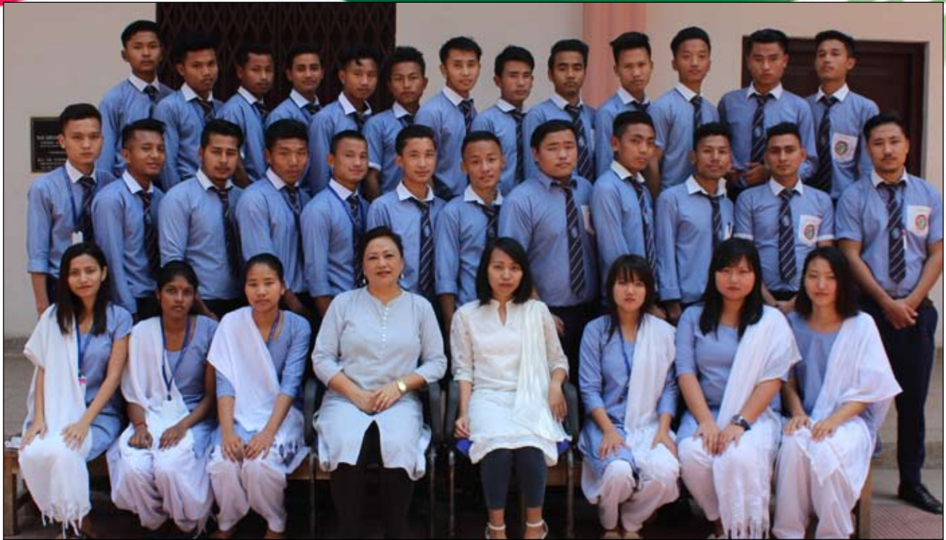
DEPARTMENT OF POLITICAL SCIENCE