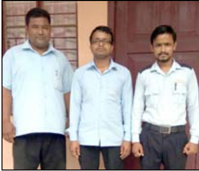
Peon, Driver & Security Guard