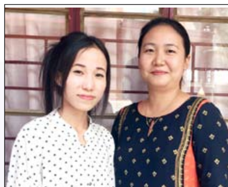
Dept. of Economics