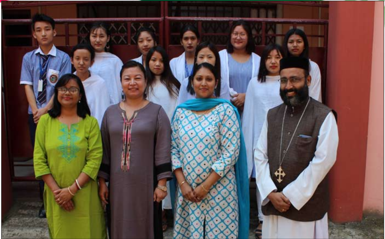
DEPARTMENT OF EDUCATION