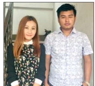
Dept. of Sociology