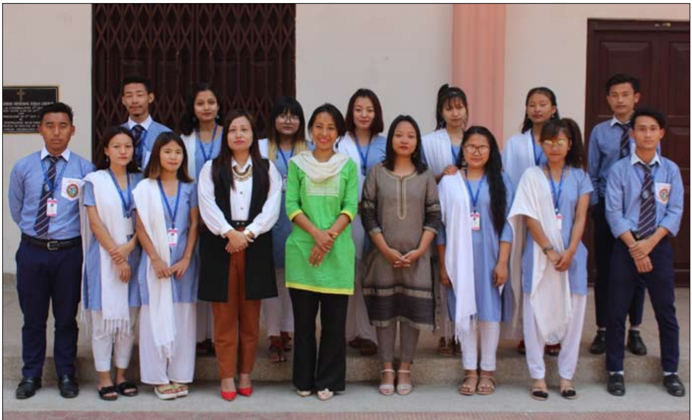
DEPARTMENT OF ENGLISH