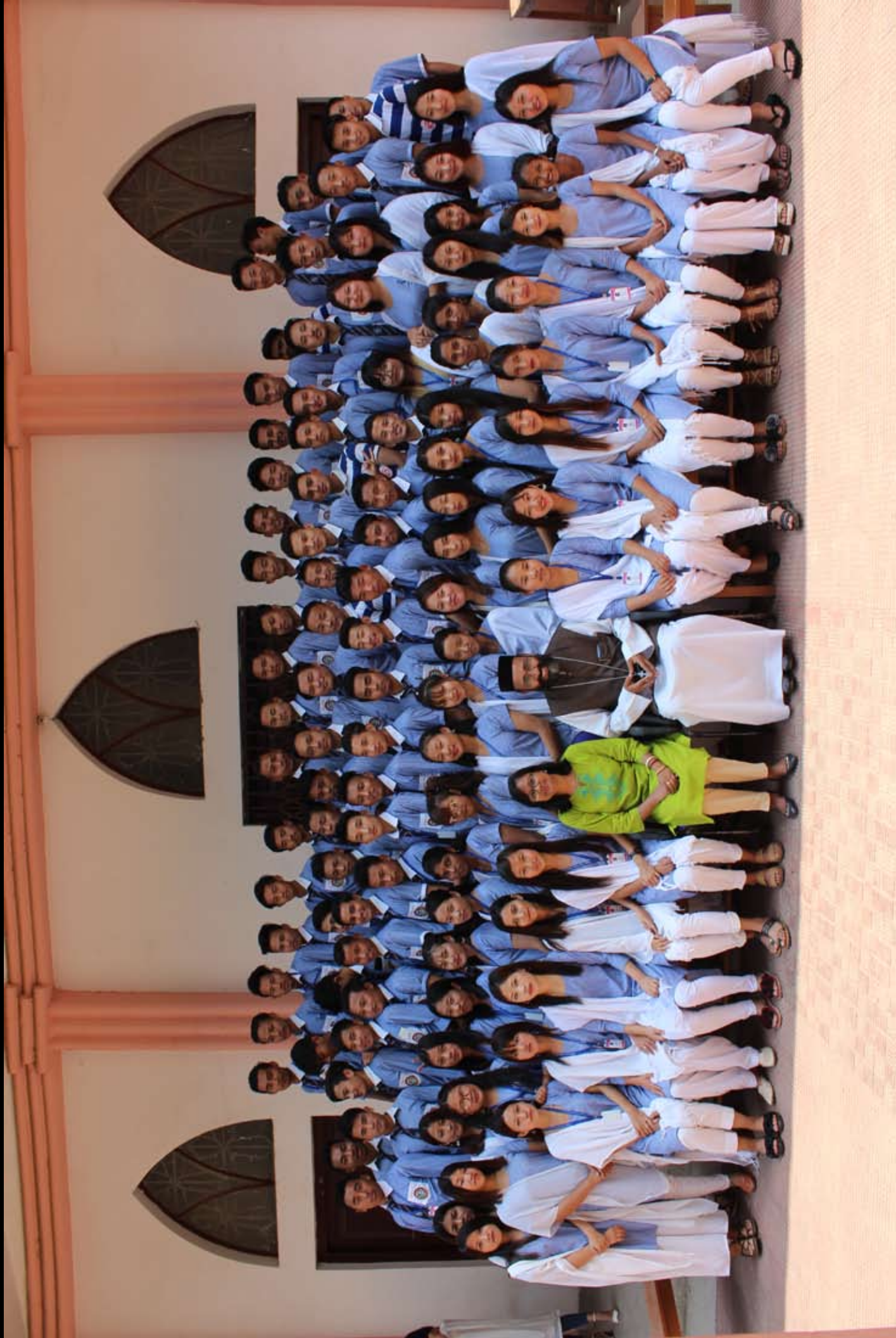
2017 - 2019 BATCH