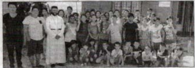
Members of the Evangelical Union and children from Ebenezer seen here during the visit.