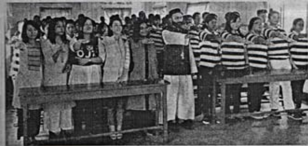
The principal and students of MGM College are seen taking oath on cleanliness at the college premises, on Sep. 12.

Dimapur, Sep. 13 (EMN): As part of a 15 day Swachhta Pachwada cleanliness drive, the 3rd semester students of MGM College, Dimapur along with Principal and faculties conducted the drive in Midland Colony.