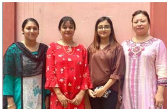
Dept. of Education