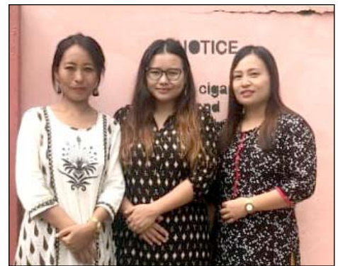
Dept. of English