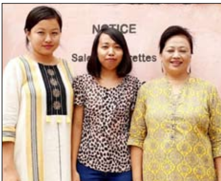
Dept. of Political Science