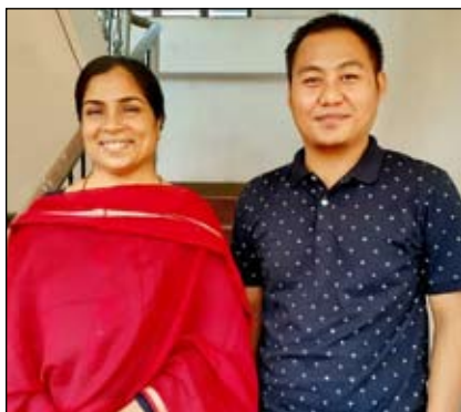
Dept. of History