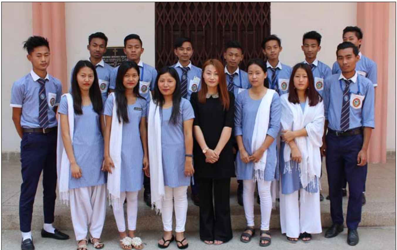
DEPARTMENT OF SOCIOLOGY