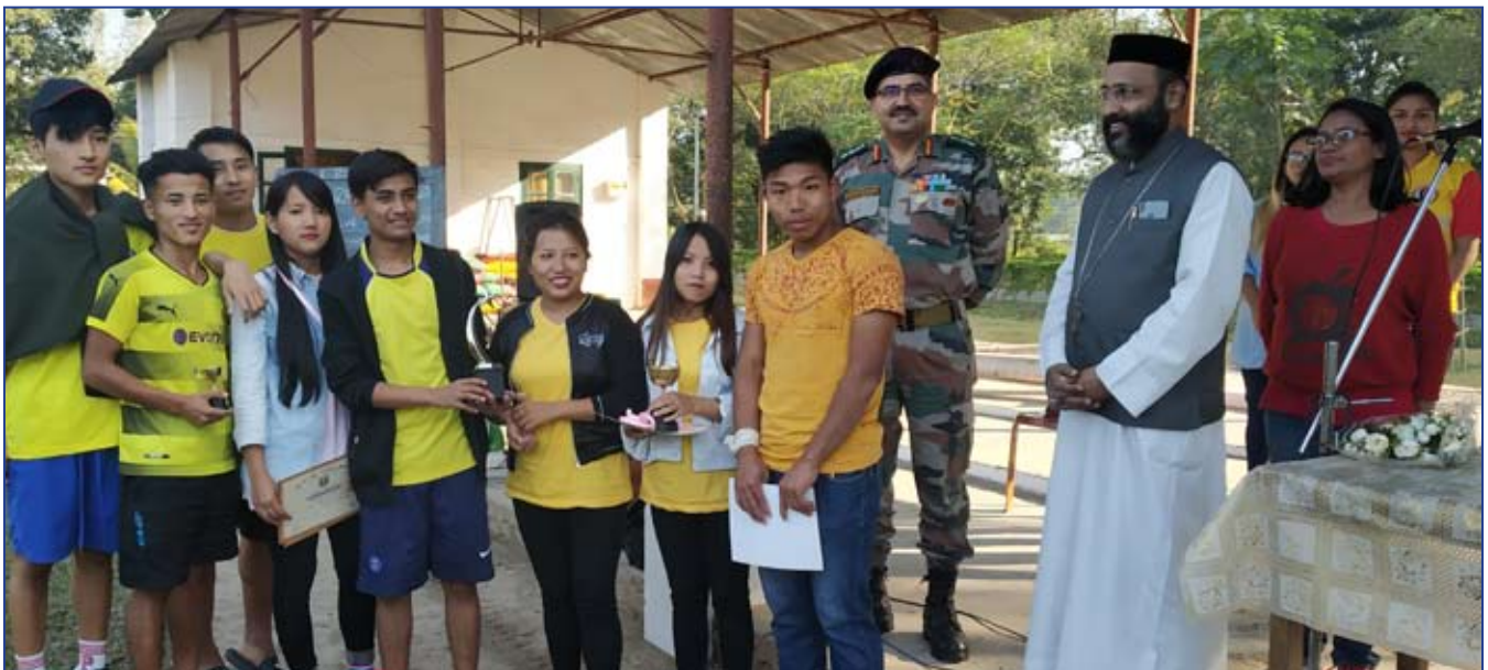
OVERALL CHAMPION: YELLOW HOUSE