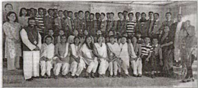
Resource person and students after the one day orientation programme and motivational class at MGM college on Nov. 23