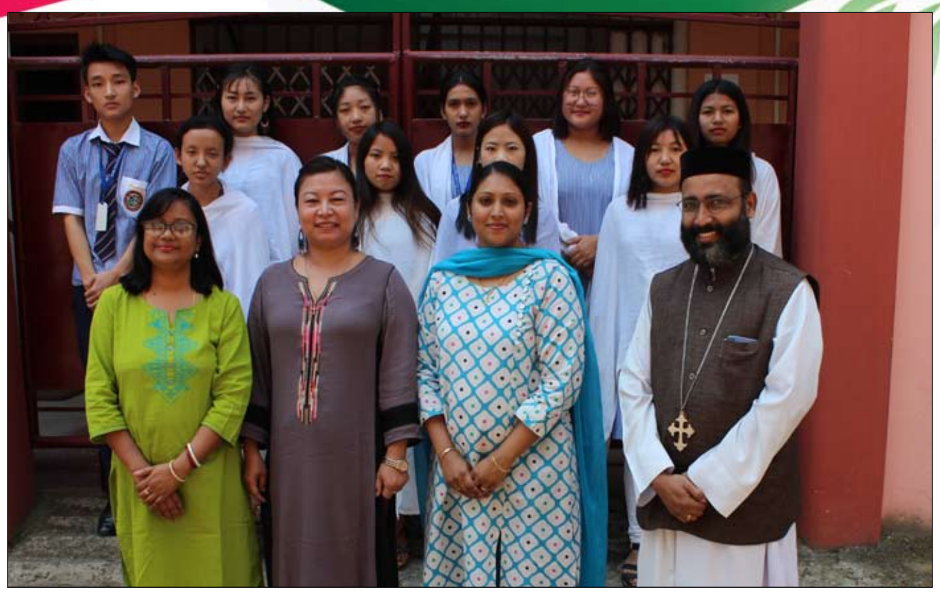
DEPARTMENT OF EDUCATION