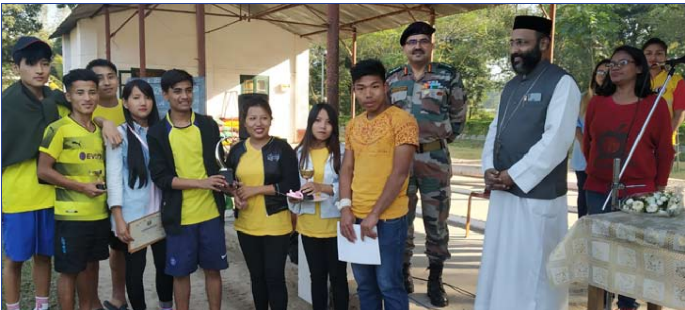
OVERALL CHAMPION: YELLOW HOUSE