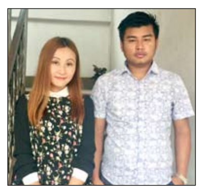
Dept. of Sociology