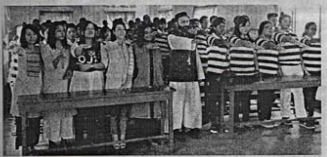
of MCM College are seen taking such on cleanileuss at the sullege premises, on Sep. 12.

imapur, Sep. 13 (EMN): As part f a 15 day Swachhta Pachwada a 15 day Swachbia Pachwada emiliosi drive, the 3rd semester dents of MGM College, Director on with Principal and faculties inducted the drive in Midland