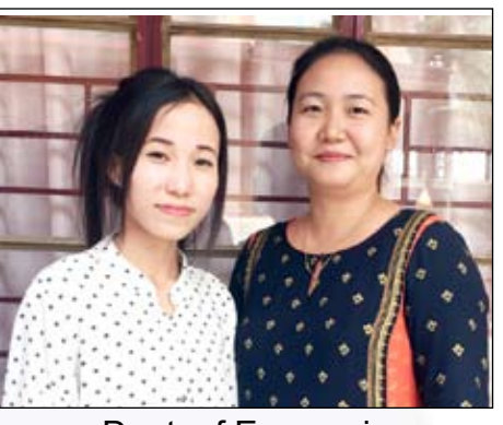
Dept. of Economics